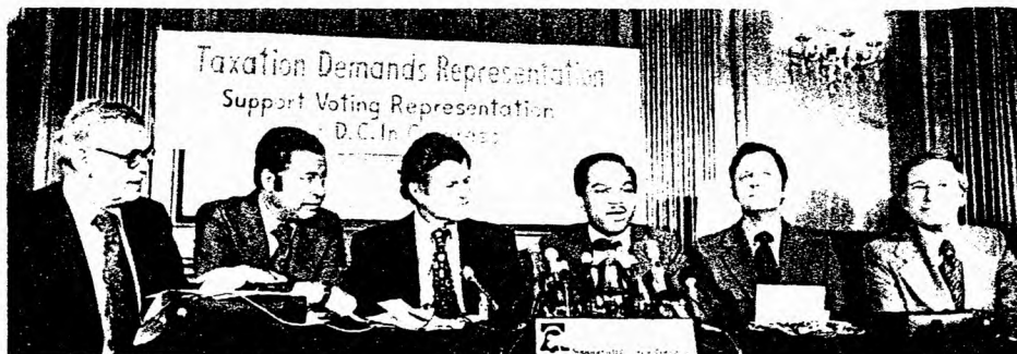
Congressman Walter Fauntroy is joined by (left to right) Congressman Gil Gude (R-Md.), Senators Edward Brooke (R-Mass.), Edward Kennedy (D-Mass.), Birch Bayh (D-Ind.) and Congressman Don Edwards (D-Calif.) in announcing drive to obtain full voting rights for the District.

Delegate Fauntroy recently sent letters to more than 800 Black elected officials around the country urging them to contact their Representative concerning H.J. Res. 280. This marks the third time that Delegate Fauntroy has introduced legislation seeking a vote on the House Floor. The Rules Committee, which has blocked the legislation in the past, has new leader-