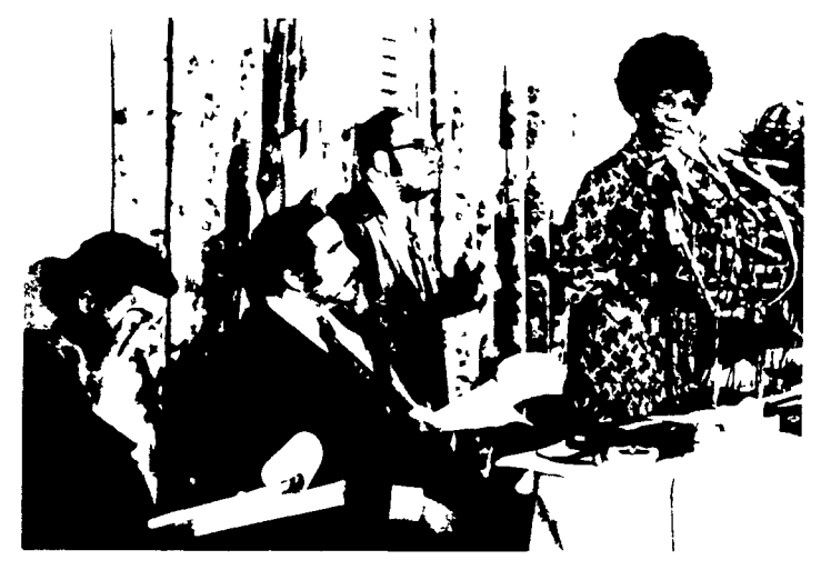
Congresswoman Chisholm holding a press conference with some of her colleagues in the Congressional Black Caucus.