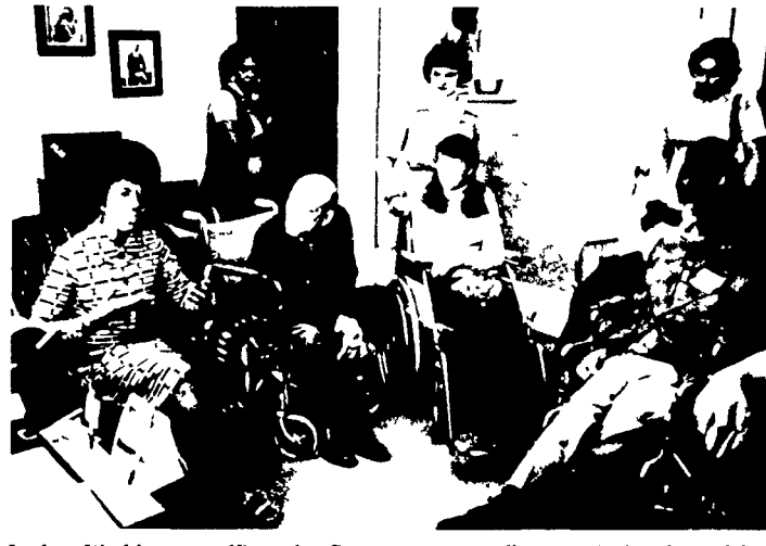
In her Washington office, the Congresswoman discusses legislation with a handicapped group.